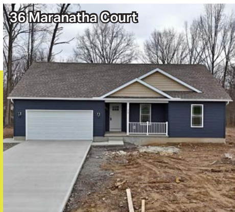
36 Maranatha Court