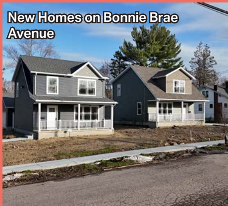
New Homes on Bonnie Brae Avenue