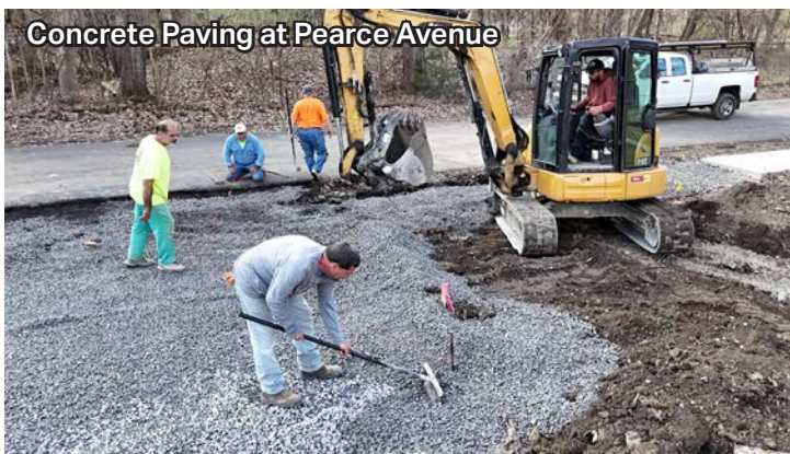
Concrete Paving at Pearce Avenue