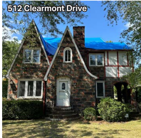
512 Clearmont Drive