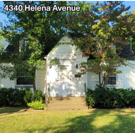
4340 Helena Avenue