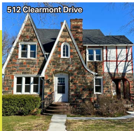
512 Clearmont Drive