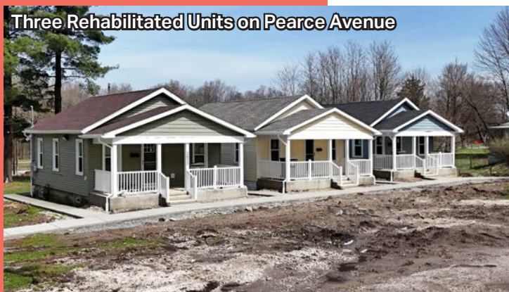
Three Rehabilitated Units on Pearce Avenue