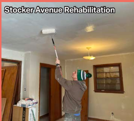
Stocker Avenue Rehabilitation