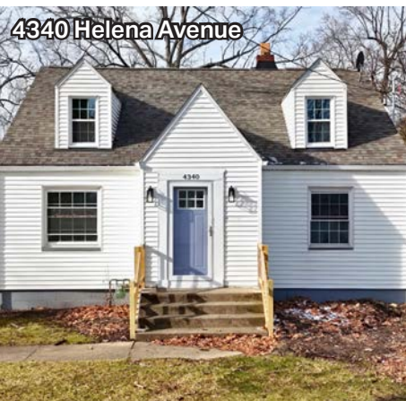
4340 Helena Avenue