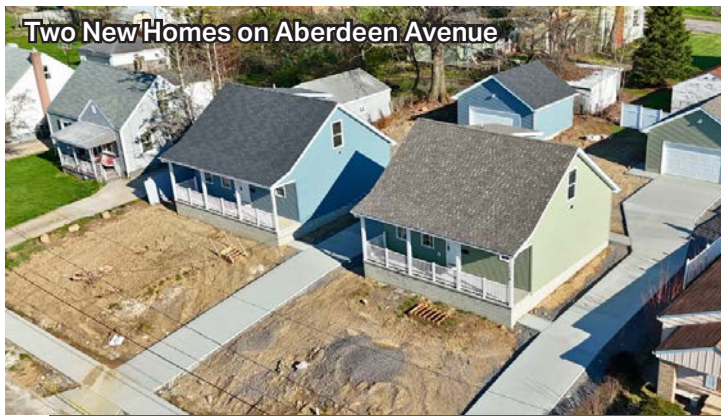
Two New Homes on Aberdeen Avenue