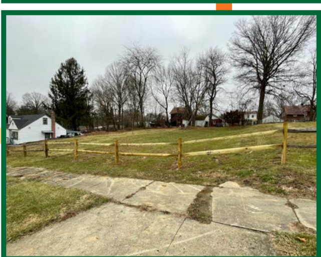
Routine maintenance of more than 420 properties, resulting in more than 7,800 cuts of grass.