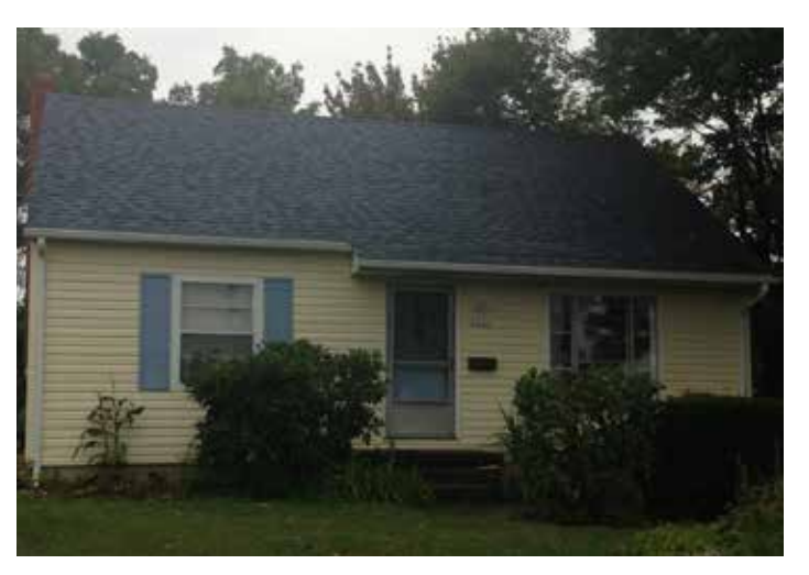
2060 Thalia: Roof, Gutters and Downspouts, Paint, Chimney Stabilization