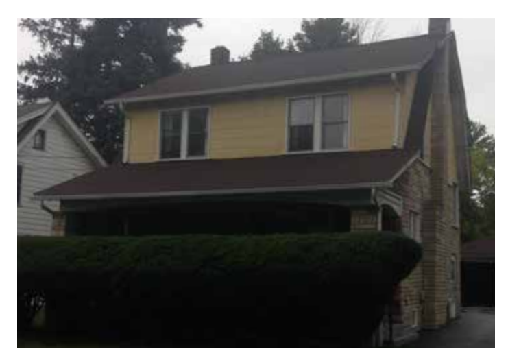
638 Parkcliff: Roof