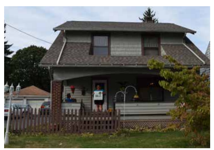
1964 Bancroft: Roof and Paint