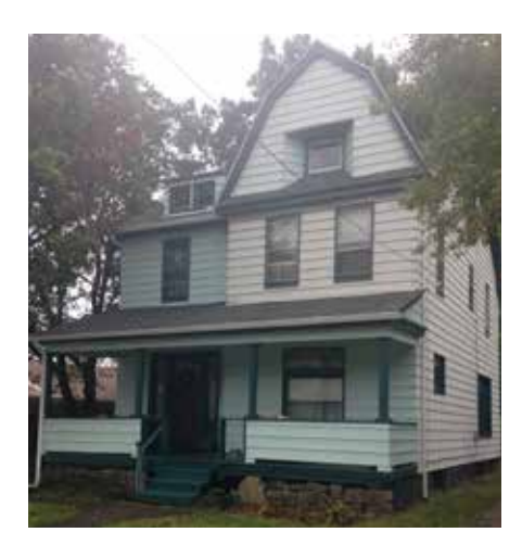
25 Willis: Roof, Gutters and Downspouts, Paint