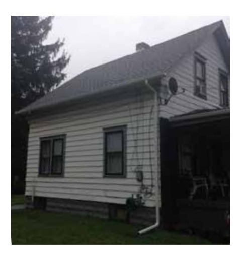
465 Sunshine: Roof, Gutters and Downspouts, Paint, Chimney Stabilization